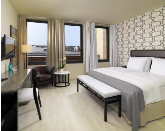
Deluxe Double Room