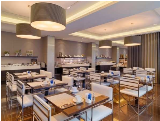
Restaurant „Salt & Pepper“

Our restaurant “Salt & Pepper” with a mix of delicate Mediterranean and international food, our bar at the lobby, our business centre and an underground garage complete our offer. Our charming typical Berlin terrace is perfectly suited for smaller events.